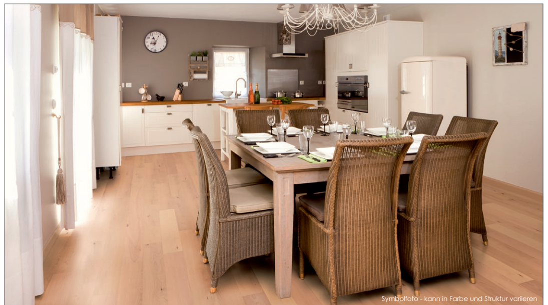
Symbolfoto - kann in Farbe und Struktur variieren