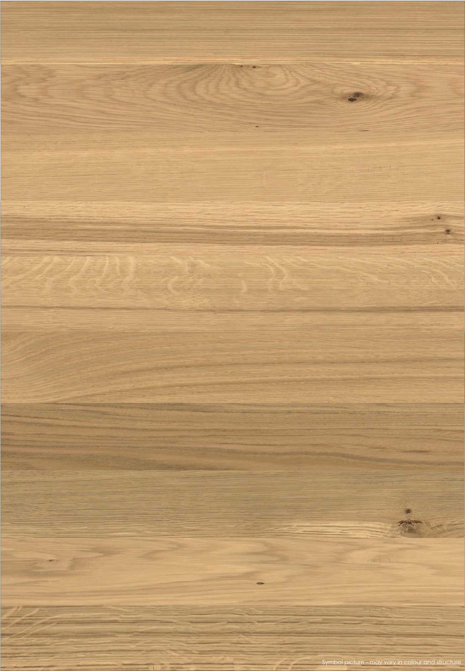
Symbol picture - may vary in colour and structure